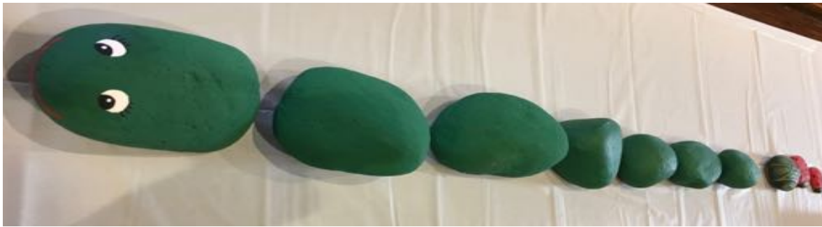
The Green Kids did a "Rock Art" project on April 5 at the Stable